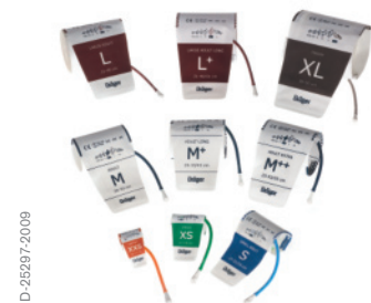
Single patient use cuffs

Regardless of the application, you can find a Dräger blood pressure cuff that can suit your patient needs. These quality cuffs can help you increase your efficiency, support hospital hygiene and improve patient comfort.