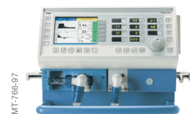
Evita 4 edition